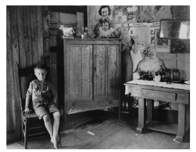
Sherrie Levine, After Walker Evans no. 6, 1981. Gelatin silver print.

heightened today, where people visiting museums are also documenting their experiences and thus creating images while or instead of looking at them.